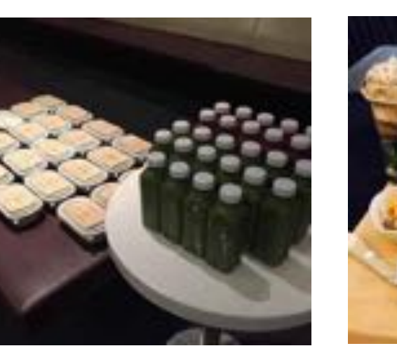
THE FACE SHOP