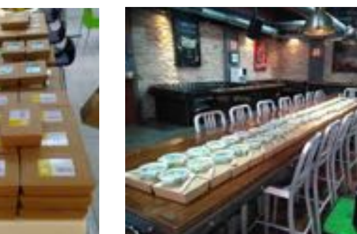
& MANY MORE!